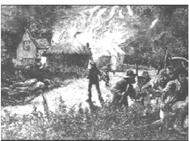
A contemporary etching of a swing riot

From "Wiltshire Machine Breakers, Volume 1, by Jill Chambers, 1993" page 72 Thursday 25<sup>th</sup> November 1830